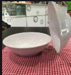
LARGE BOWL AT SALAD BAR