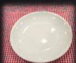
MEDIUM PLATE OR BOWL

500 points or €6.00 cash -Second Course- (Meat, or Fish, or Vegetarian, or Vegan)