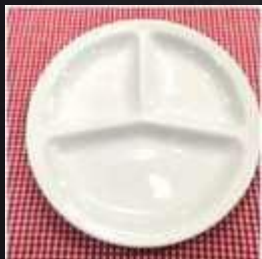
LARGE PLATE WITH DIVIDERS