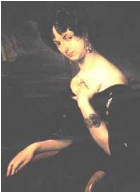
■ Cristina Trivulzio di Belgiojoso